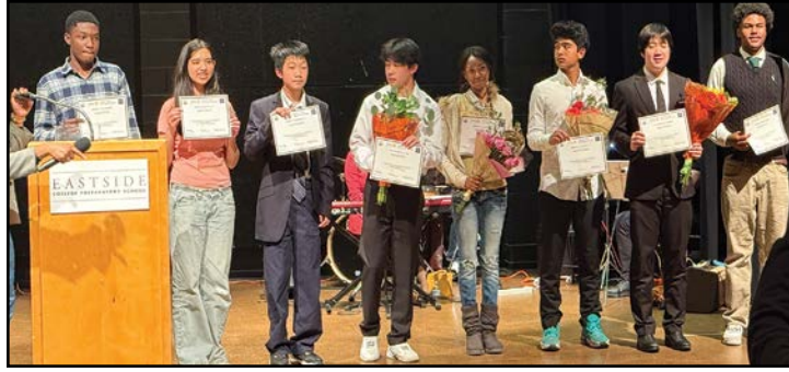
Speaking on "Service above Self" at Rotary page 6