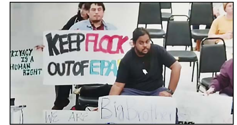
East Palo Alto residents held up protest signs at the April 7, 2026 East Palo Alto City Council meeting in which councilmembers and residents discussed the use of Flock cameras in the city.

At the center of the dispute was whether the Flock camera item should be heard at all. Coun-