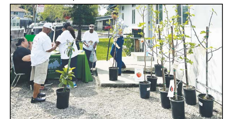
Congregants of Calvary Temple line up to adopt a fruit tree during the congregations' monthly barbecue fundraiser.

The program also serves another purpose: identifying future opportunities for canopy growth.