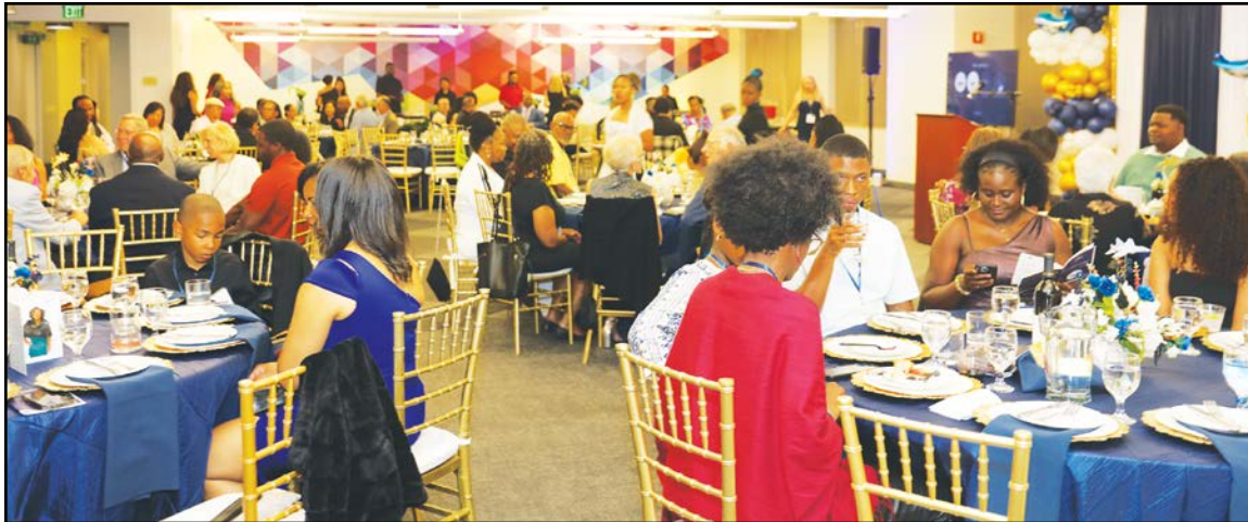
All of the guests who attended the March 21 Bay Area Urban Eagles event entertained themselves over dinner as they awaited the evening's presentation.

Attendees were treated to a youth aviation showcase, flight