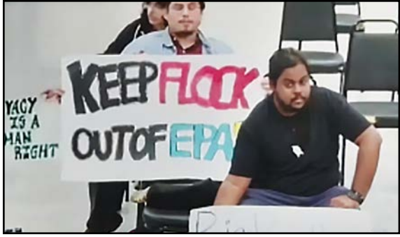
East Palo Alto Council deadlocks on Flock.. page 3